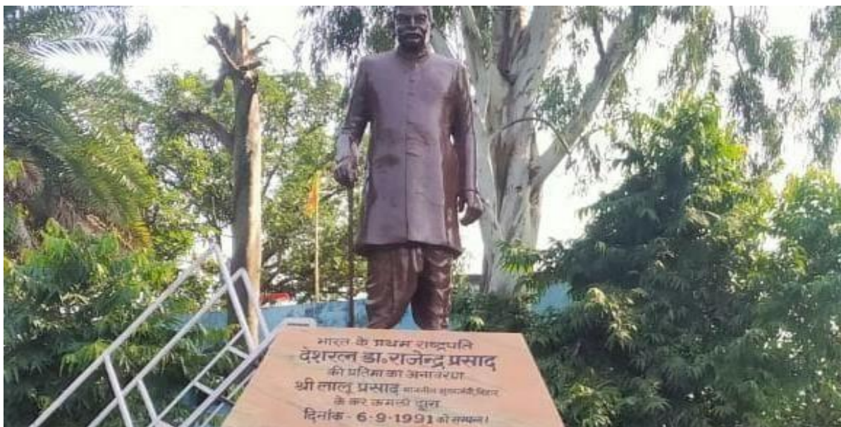
Statue Of India's First President Dr. Rajendra Prasad

In addition to visiting the ancestral home, the group engaged in interactive sessions with local historians and scholars who provided detailed accounts of Dr. Rajendra Prasad's contributions to the nation. These sessions were particularly beneficial for the teacher trainees, as they highlighted the importance of integrating historical perspectives into modern educational practices. The tour also included visits to nearby landmarks and institutions associated with Dr. Rajendra Prasad's life and work, further broadening the participants' understanding of his enduring legacy.