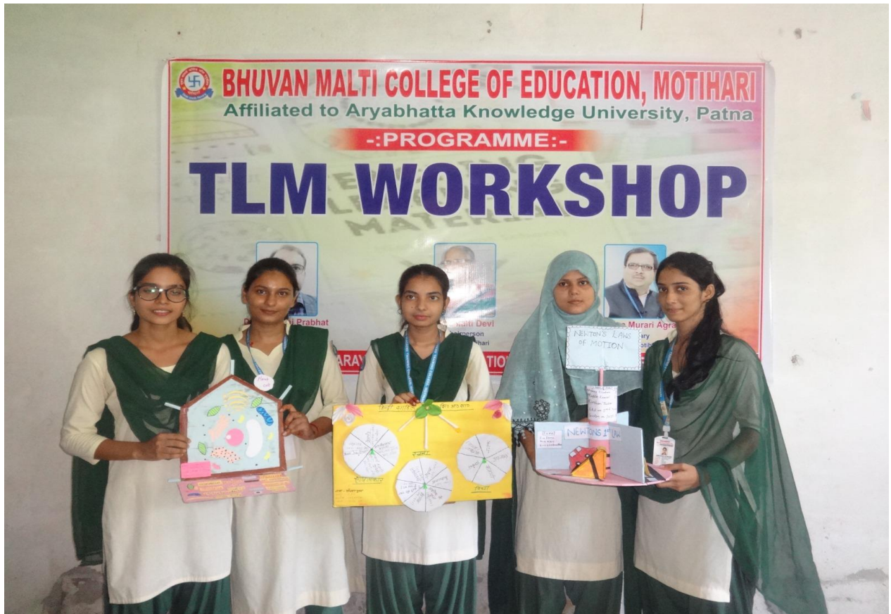
Students Complete TLM Project and Exhibition their skill.