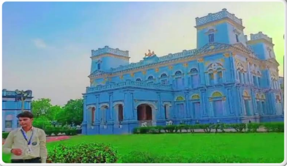
Photographs of Museum and Hathwa Raj Palace During Educational Tour.

Today, Hathwa Raj Palace remains a symbol of the region's history and culture. It attracts tourists and history enthusiasts who are keen to explore its architectural beauty and historical importance. The palace is also used for various cultural events and functions, keeping its legacy alive. Hathwa Raj Palace stands as a testament to the rich history and cultural heritage of Gopalganj, Bihar. Its architectural grandeur and historical significance make it an important landmark in the region. Preserving and promoting such heritage sites is crucial for understanding and appreciating the diverse history of India.