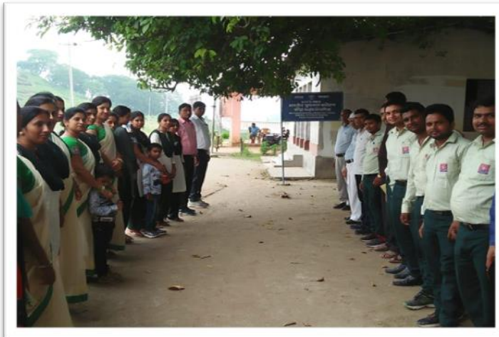
Educational tours often include visits to industry-specific sites

Independence and Responsibility: Being away from home in a new environment teaches students to be independent and responsible. They learn to manage their time, belongings, and