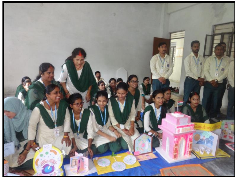
Students with our TLM Project

In conclusion, Teaching Learning Materials form the backbone of effective education, offering a versatile toolkit for educators to impart knowledge and foster meaningful learning experiences. Thoughtfully designed TLMs contribute to a student-centric, inclusive, and engaging learning environment, ultimately equipping students with the skills and knowledge necessary for success in an ever-evolving world. As we continue to advance in educational methodologies, the significance of well-crafted Teaching Learning Materials remains paramount in shaping the future of learning.