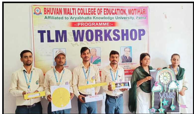
Students made and presented their TLM Projects

In the dynamic landscape of education, the role of Teaching Learning Materials (TLM) cannot be overstated. These materials serve as crucial tools in the hands of educators, facilitating the transmission of knowledge and fostering meaningful learning experiences for students. Thoughtfully designed TLMs contribute significantly to the effectiveness of teaching methods and help create an engaging and enriching educational environment.