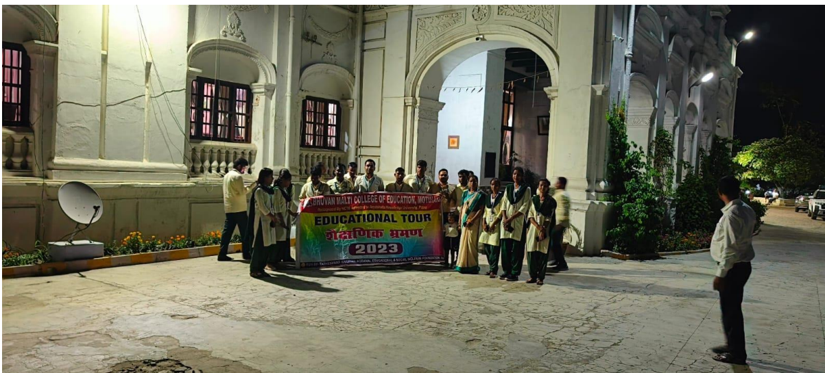
Photographs on Front of Hathuwa Raj Palace of Students on Educational Tour.

The tour guide shared fascinating stories about the royal family, their contributions to the community, and their role in the historical events of the time.