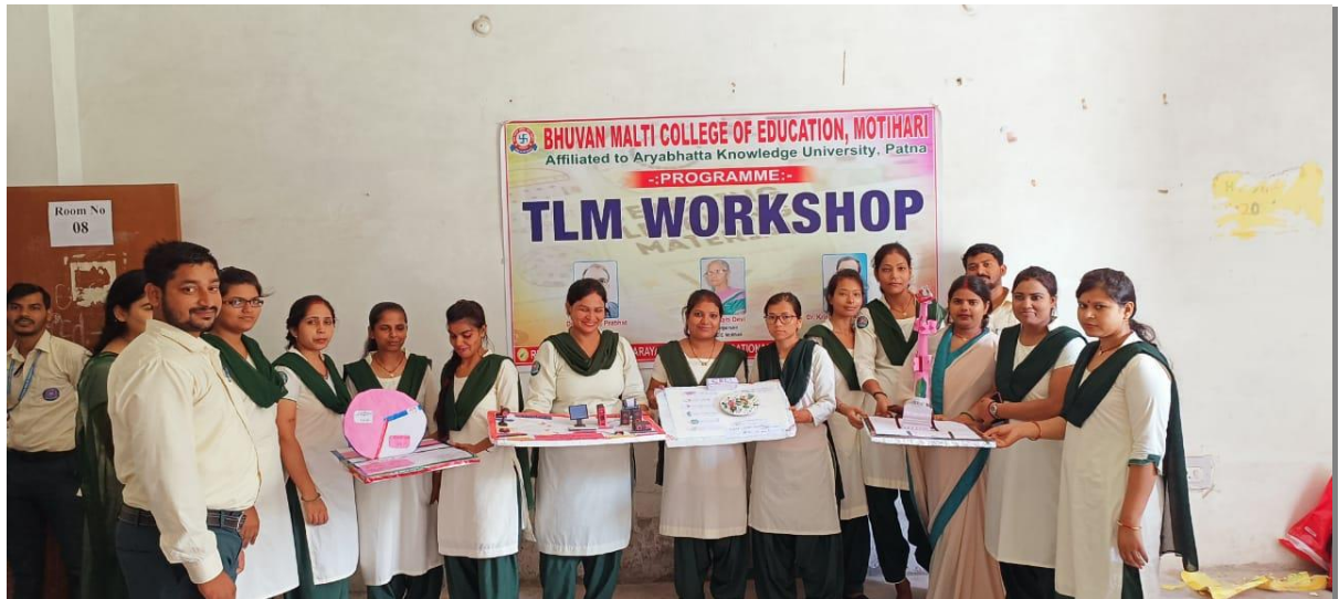
Students Photographs with their TLM Project.