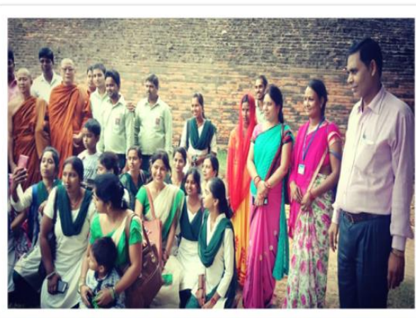
Students visit Kesaria Boudh Stupa on Education Tour with Faculty.

Educational tours are a vital component of the learning process, offering students a unique opportunity to expand their horizons beyond the confines of classrooms. These excursions provide a hands-on, experiential approach to education, fostering personal growth, cultural understanding, and real-world application of theoretical knowledge. Let's explore the numerous benefits of educational tours.