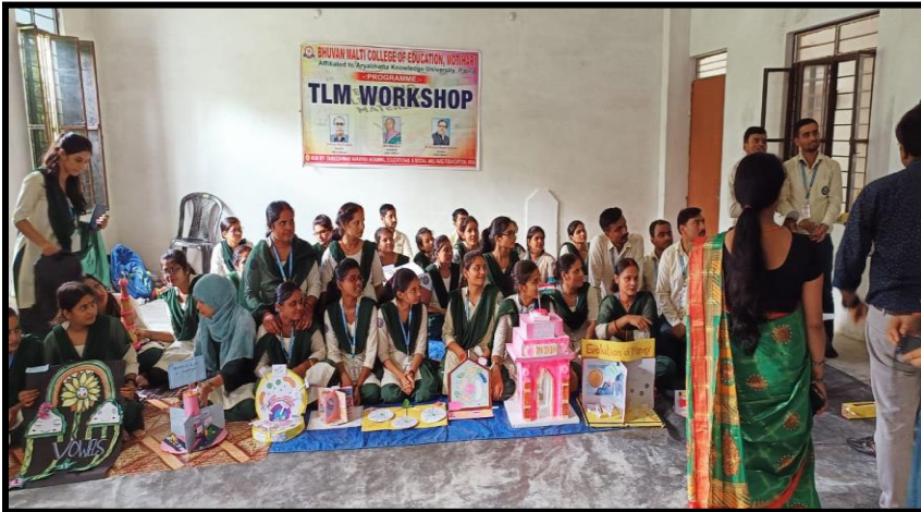
Faculty Inspect TLM Project Prepared by Students

Teaching Learning Materials encompass a wide range of resources, including textbooks, visual aids, audio-visual materials, interactive software, and hands-on activities. These materials play a pivotal role in catering to diverse learning styles and ensuring a comprehensive understanding of the subject matter.